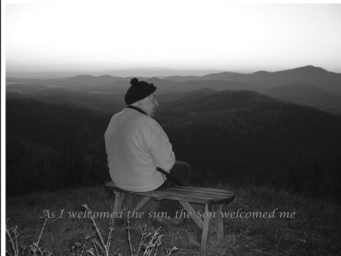
As I welcomed the sun, the Son welcomed me