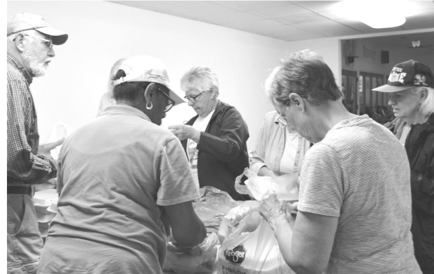
Volunteers at Mac's Kitchen at Our Lady Queen of Peace Parish, Appomattox, pack lunches that will be distributed to the kitchen's clients.

Then Jesus took the loaves, gave thanks, and distributed them to those who were reclining, and also as much of the fish as they wanted. John 6:11